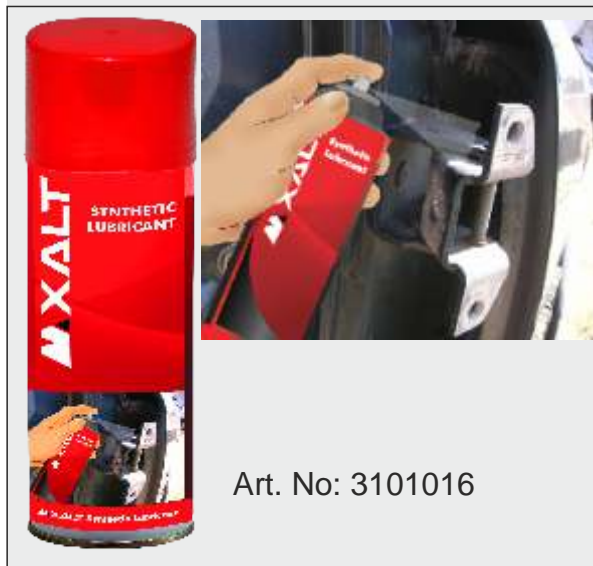
Art. No: 3101016

High pressure resistant liquid grease which offers superior lubricants. Ability to with stand high temperatures. Resistant to water, salt water, mild acids and alkalis. Protects and prevents from corrosion. High creeping and penetrating abilities. Stop squeaky noises, help lubricate and free rusted parts. Excellent adhesion power. In-built nozzle will help to spray in accessible areas. Contains no silicone and acids.